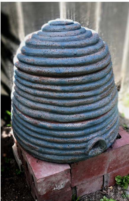
The beehive is functional!